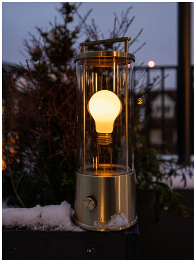
DGM 287 – “The Muse Solid Brass” | Designed by Tala for Tala