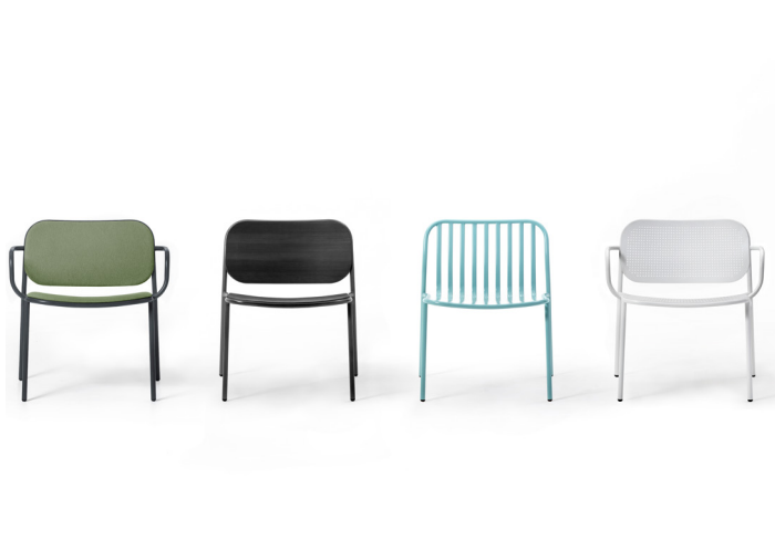
DGM 294 – “Metis” | Designed by Gabbertas Studio for TrabA