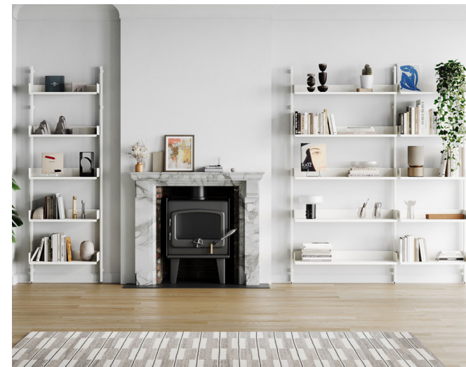
DGM 312 – “Slot Shelving” | Designed by Terence Woodgate for Case Furniture