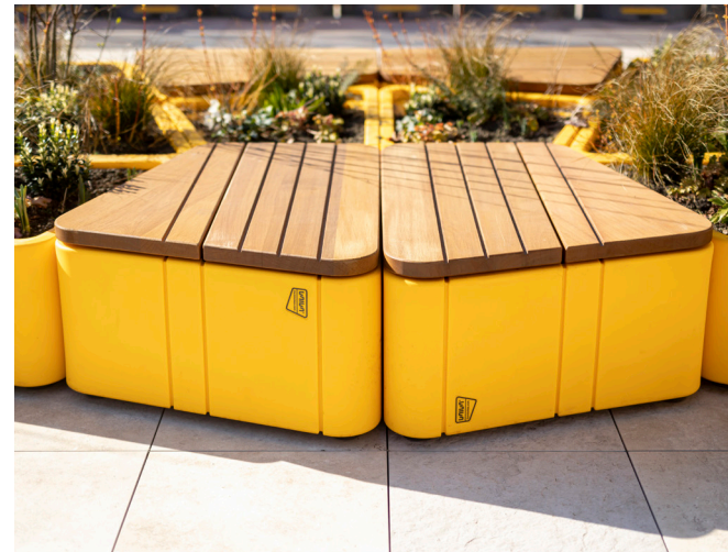
DGM 303 – “Union Bench & Planter” | Designed by Furnitubes for Furnitubes