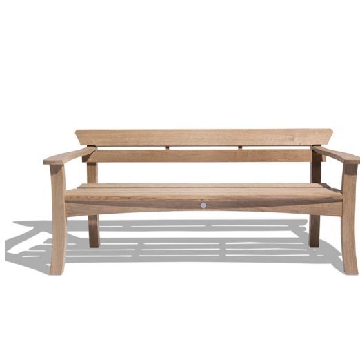
DGM 302 – “Amity Seat” | Designed by The Gaze Burvill Design Team for Gaze Burvill