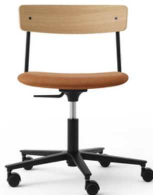
DGM 310 – “Cross Task Chair” | Designed by PearsonLloyd for TAKT