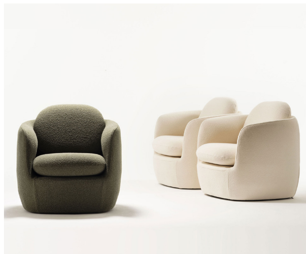
DGM 290 – “Bilbao” | Designed by Tim Rundle for Morgan Furniture