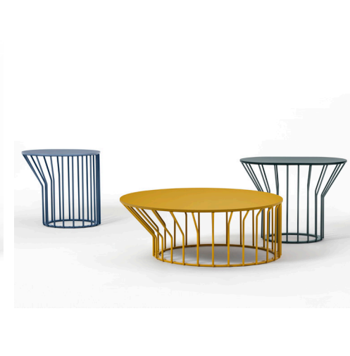
DGM 295 – “Jump” | Designed by Gabbertas Studio for TrabA